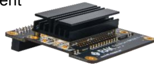
RAK2245 Pi HAT (1x)